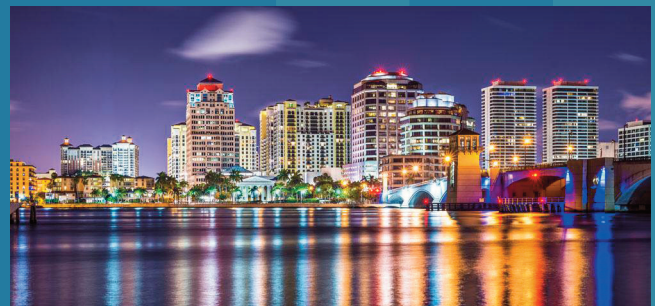
Majestic West Palm Beach welcomes a World of Possibilities